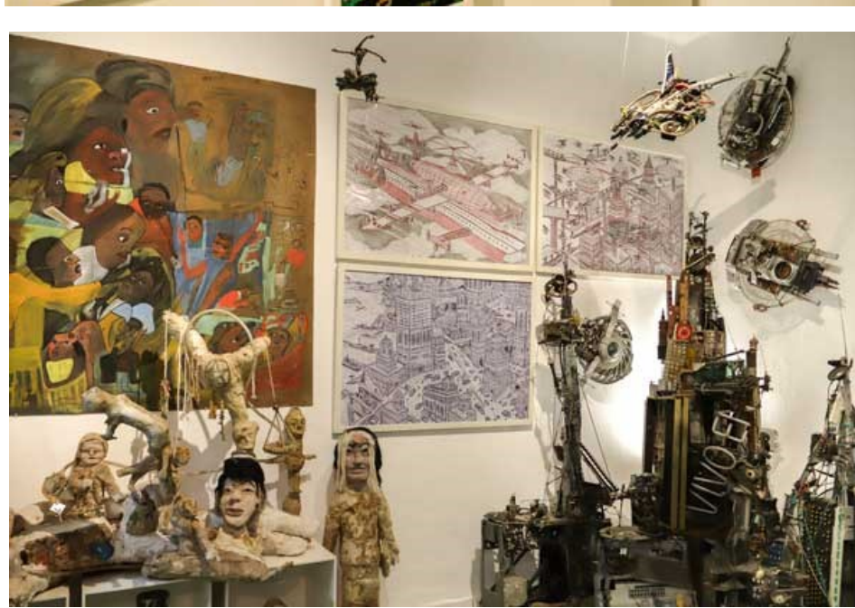
From January 12th until March 31rst, RIERA STUDIO | Art Brut Project Cuba is a comprehensive exhibition of Cuban Art Brut and Outsider Art made by 35 artists that this studio comprises, including the exhibition for the first time of new artists' work. This exhibition is also supported by the Embassy of Norway in Cuba.